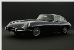
Jaguar E-Type the most iconic car of the past 50 years in the UK

We enjoy a leading position in the commercial vehicle industry in most segments. We also figure among the top three in passenger car players in the country with differentiated products in the compact, midsize car and utility vehicle segments.