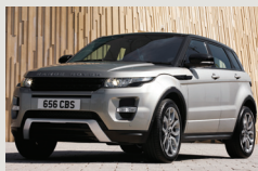
Land Rover Evoque won over 100 awards since its launch in 2011