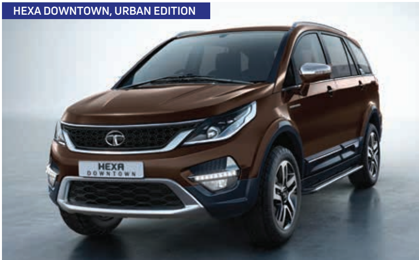
HEXA DOWNTOWN, URBAN EDITION