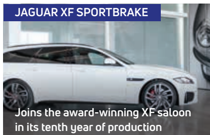
JAGUAR XF SPORTBRAKE

Joins the award-winning XF saloon in its tenth year of production