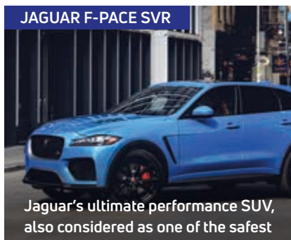
JAGUAR F-PACE SVR

Jaguar's ultimate performance SUV, also considered as one of the safest